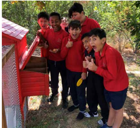
Our first egg laid by one for the chooks at Furlong Park School.

Over the holiday, we had two exciting projects happening in our school. We now have a new garden shed and chook coop for our two new additional family (chooks). Furlong Park will develop a Kitchen Garden Program with a focus on closed-loop recycling and how the chickens and garden support this process. The program provides opportunities to develop important life-skills with hands-on experience about where our food comes from, how our choices can impact on the environment and develop an awareness about the eco-system at Furlong Park.