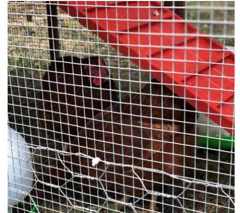
Welcome our new chooks, Sunrise and Pip.